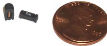
Sen-XY (horizontal mount) Sen-Z (vertical mount)

are designed to enable 3D (RM3000) and 2D (RM2000) applications and are optimized for use in game controllers, solid-state navigation devices, and handheld devices with integrated compassing functions. The Suites consist of 2 or 3 Reference Magnetic sensors driven by PNI's 3D MagIC ASIC. The interface to the 3D MagIC ASIC is through an SPI bus; eliminating the need for signal conditioning or an analog/digital converter.